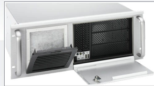
Lockable front door with operating elements