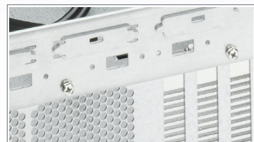
Break-outs for rear-side interfaces