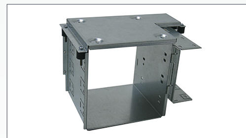
Vibration-damped drive cage