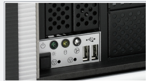
2 × front-side USB 2.0 ports