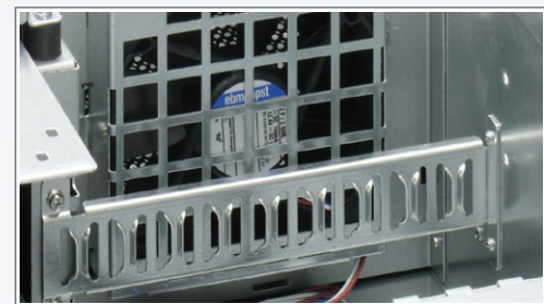
Card holders for long cards