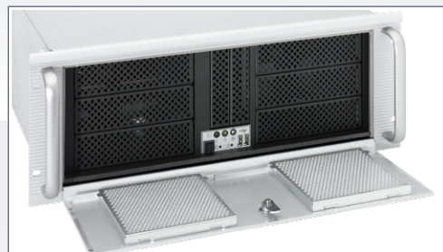
Lockable front door with operating elements