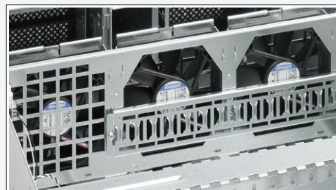
Fan bank inside the chassis with 120 mm fans and card holders for long cards