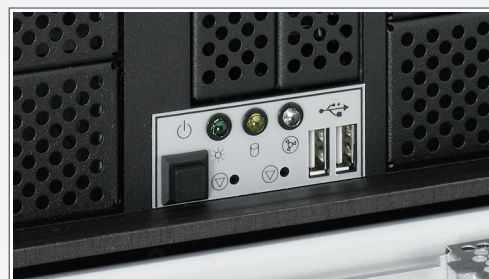
2 × front-side USB 2.0 ports