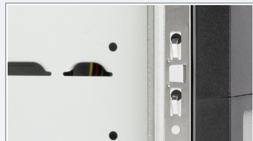
Integrated steel springs at the case edges for maximum EMC protection