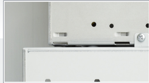
Folded edges on all open panels and plates