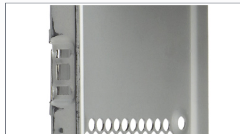
Mount for intrusion switch