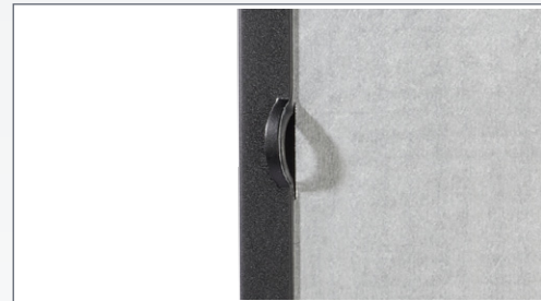
Anti-theft solution with lock tab